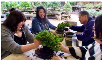
Take a bonsai making class at 11am for $60

COME CELEBRATE WORLD BONSAI DAY, SATURDAY MAY 11! (Page 2)