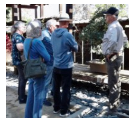
Take a docent led bonsai tour