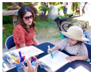
Draw or color bonsai