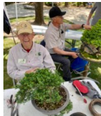
Watch bonsai demonstrations