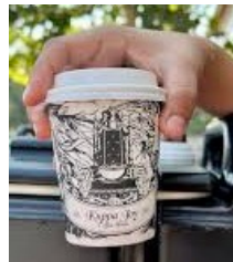
Have a delicious Kuppas Joy Coffee