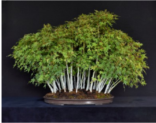
Japanese Maple Forest By Irene Tamura