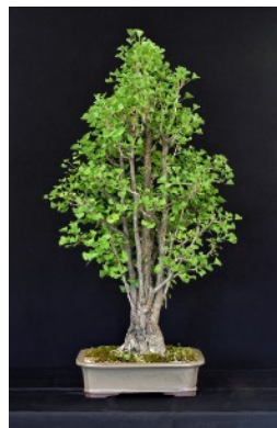
Ginkgo Clump