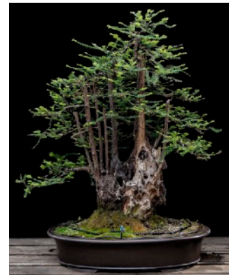
Coastal Redwood Clump By Kenji Miyata