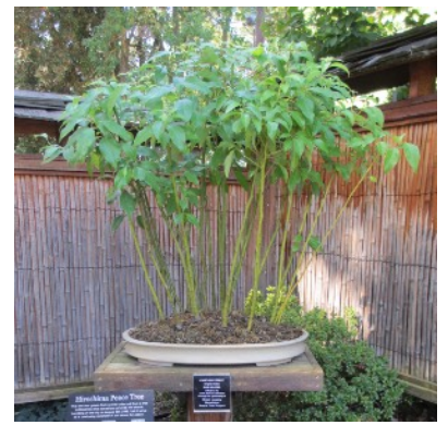
Camphor Peace Tree Forest By Bob Hilvers