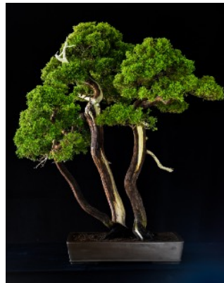
Shimpaku "3 Dancers" By Unknown Artist