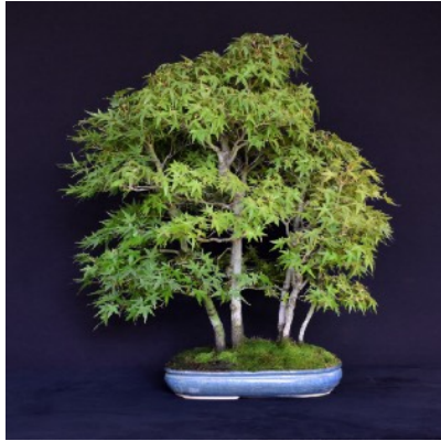
Japanese Maple Forest By Irene Tamura