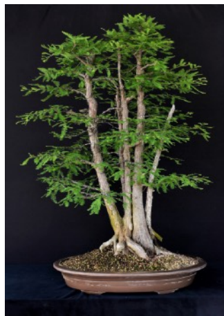
Montezuma Cypress